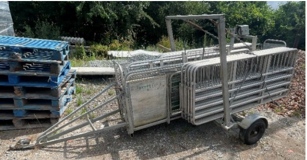
Lot 59 Bateman Galvanized Cattle Crush c/w Weigh scales