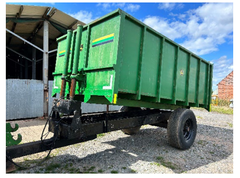
Lot 136 Grain Trailer (Lorry Conversion)