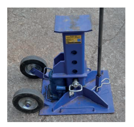
Lot 25 - Draper Sprayer Jack